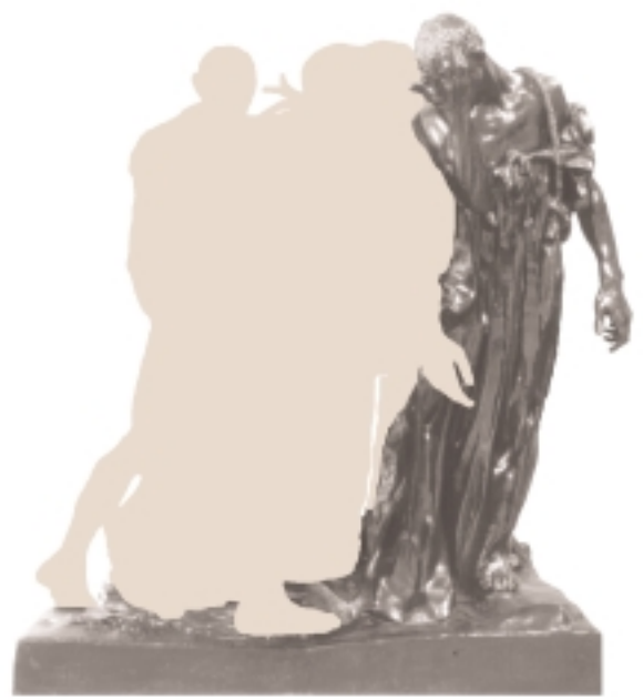
Pierre de Wiessant (FRONT VIEW)