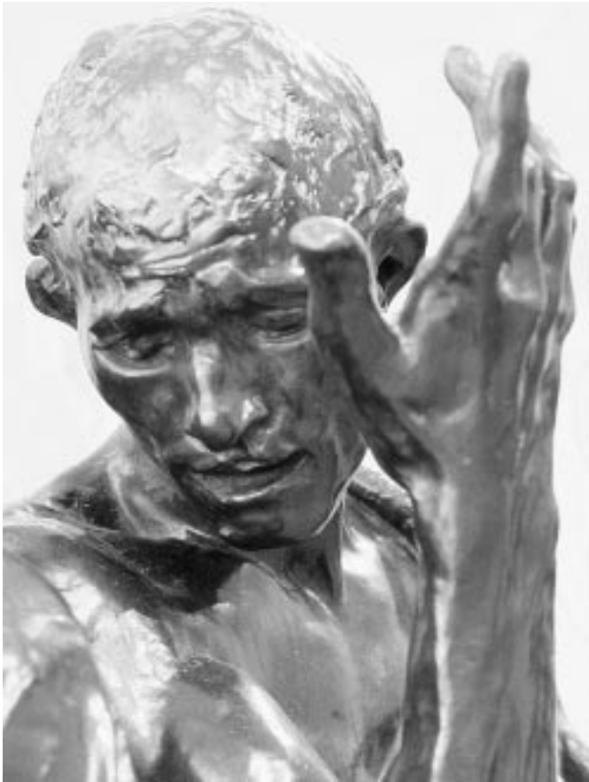
PIERRE DE WIESSANT