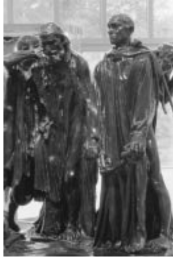
Eustache de Saint-Pierre and Jean d'Aire

Eustache de Saint-Pierre is the richest, oldest, and most prominent citizen of the group and the first to volunteer.