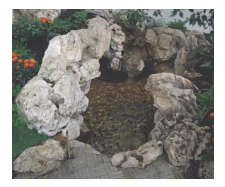
Deep Jade Green Spring (Hanbi Quan) contains goldfish, which add color and liveliness.

because it was highly prized for its rich color, fine grain, and its ability to repel insects. The horizontal beams and some of the rafters of the garden court are made of fir; the curved rafters in the back of the Ming Room and the balustrades are constructed of camphor wood; and the room's window frames and lattice work are made of gingko wood. The ceramic floor and ceiling tiles were produced in a former imperial kiln outside Suzhou that was reopened for this project (page 13, bottom). The stonelike, bluish-gray color of the floor tiles is achieved by reducing the amount of oxygen in the kiln during the firing.