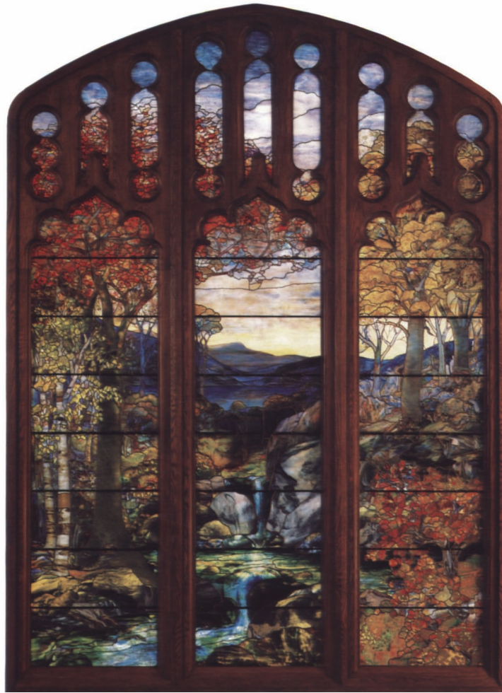
Louis Comfort Tiffany, Autumn Landscape , stained glass, 1923

In fall the landscape is painted and the body is cloaked in soft russets, oranges, leaflike changeant burnished golds, deep browns, and earth tones. Friction of materials with the skin is a welcome pleasure as days grow cooler and the more substantial wools, cotton corduroys, and velvets increasingly supplant the lighter, less textural fabrics of summer. Our impression of eighteenth-century dress may lead us to expect silk and décolletage, but the Kimberley gown, an English open robe and petticoat (ca. 1695) in gray-brown-blue wool with silver gilt embroidery, refutes those expectations. On the contrary, the Kimberley gown testifies to seasonal differentiation as early as seventeenth-century dress through its fabric, color, and body coverage. Correspondingly, tan and brown corduroy suits for