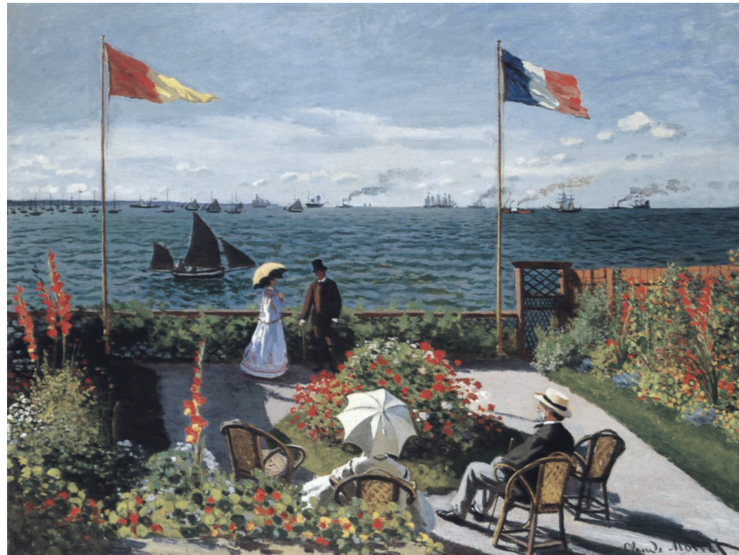
Claude Monet, Garden at Sainte- Adresse , oil on canvas, 1867

In The Secrets of Distinctive Dress (1918), Mary Brooks Picken admitted: “Elderly mothers have come to realize that they look ten years younger and are ten times more comfortable on a warm summer’s day in a pretty, soft white dress, and it is pleasing to see a group of such mothers dressed in pretty, light wash dresses as they appear many times as attractive as a group of young women.”