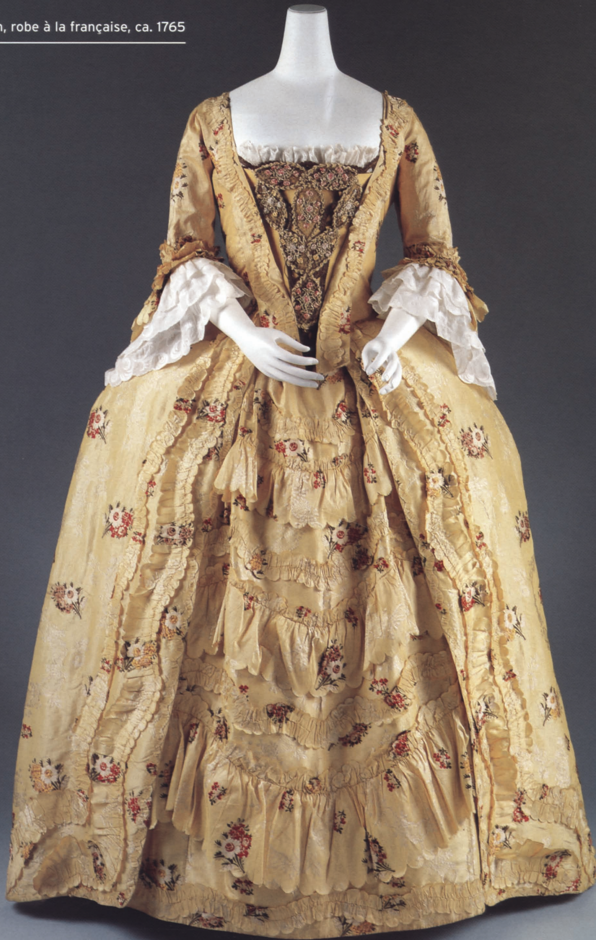
English, robe à la française, ca. 1765