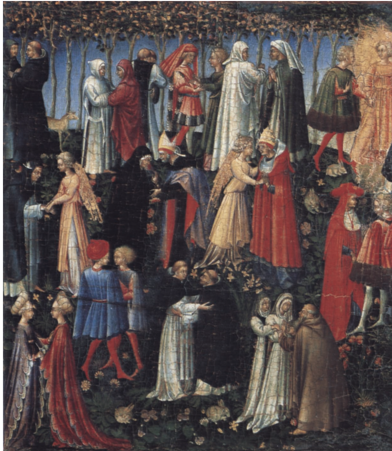
Giovanni di Paolo, active by 1417- died 1482, Paradise , tempera and gold on canvas

The seasons have established their conventions, and the passages of light and temperature can govern some behaviors, but contemporary fashion has yielded to a new principle of seasonless dressing. Of course, the model is not wholly new. The utility of accompanying an Empire gown of sheer cotton with a wool Kashmir or Paisley shawl was a logical compromise as early as the 1800s. Travel, controlled environments, and ever more versatile fibers and fabrics encourage us to live beyond the seasons and to become men and women for all seasons.