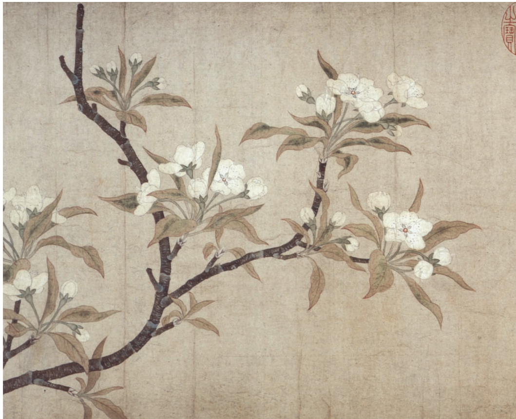
Ch'ien Hsuän, Pear Blossoms (detail), hand- scroll, ink and colors on paper, ca. 1280

Spring showers and spring flowers dominate this season's wardrobe, but the season's festive association with fashion—especially the Easter bonnet—renews the wardrobe in accord with nature's apparent rebirth. From the flower-sprouting mantuas of the eighteenth century to the beguiling spring dresses of the 1920s and 1930s, nature's rejuvenation enters into the spirit of spring dress.