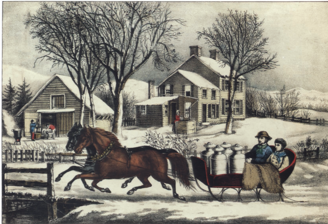
Currier & Ives, Winter Morning in the Country , lithograph with colors, 1873

The winter wardrobe is an arsenal of techniques for fending off the cold and capturing all available warmth. Quilting creates a natural layer of downy protection, and animal pelts and their simulation in plush provide a cuddly defense against cold winds. Both are eternal verities of the winter wardrobe, extending from eighteenth- and nineteenth-century examples to contemporary fashion.