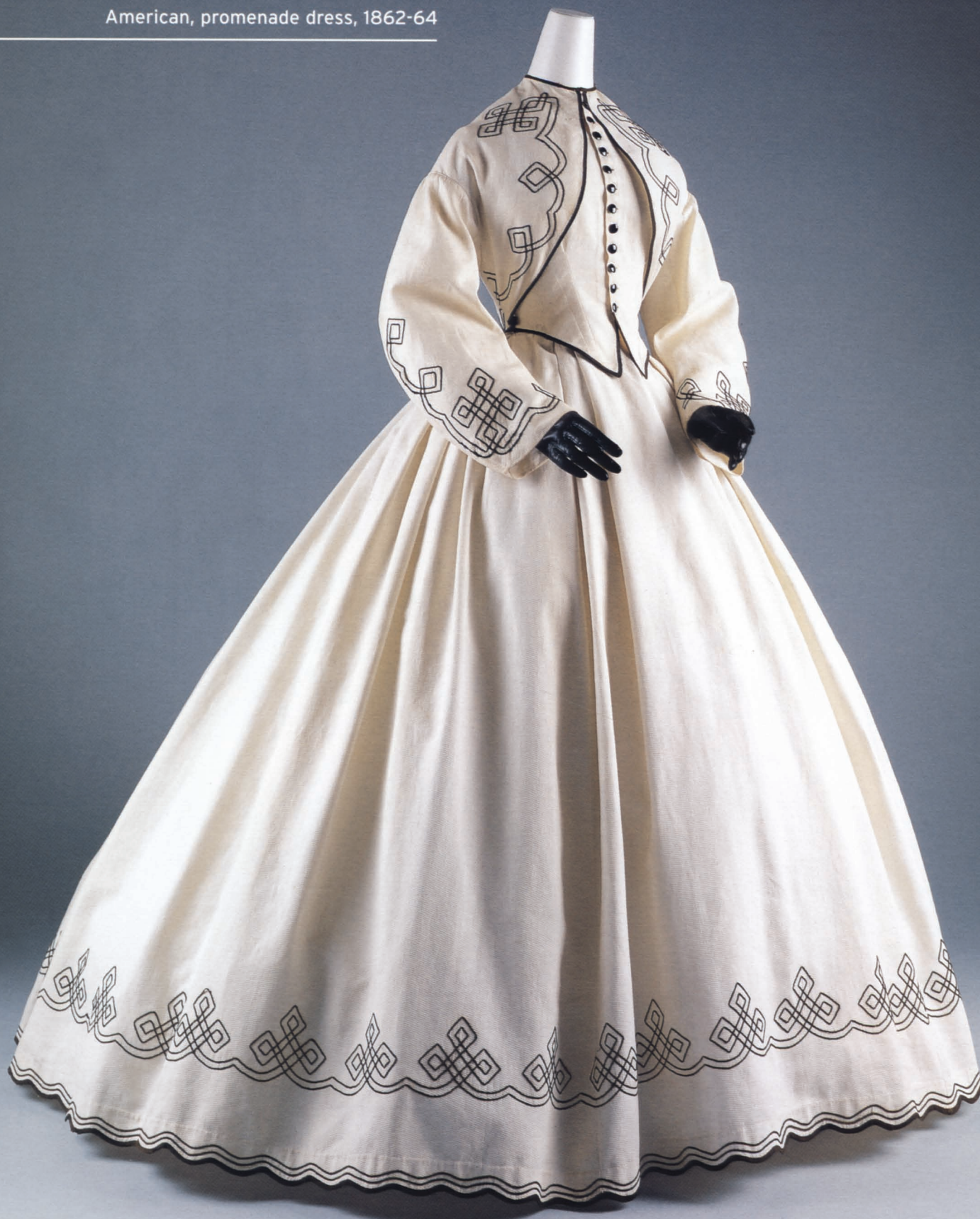
American, promenade dress, 1862-64