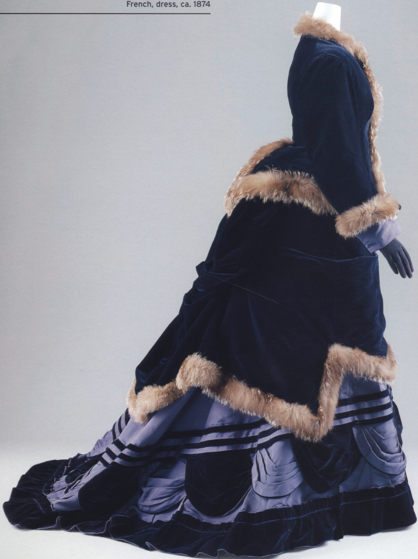
French, dress, ca. 1874